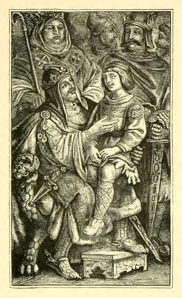
LOUIS OF FRANCE AND THE LITTLE DUKE.